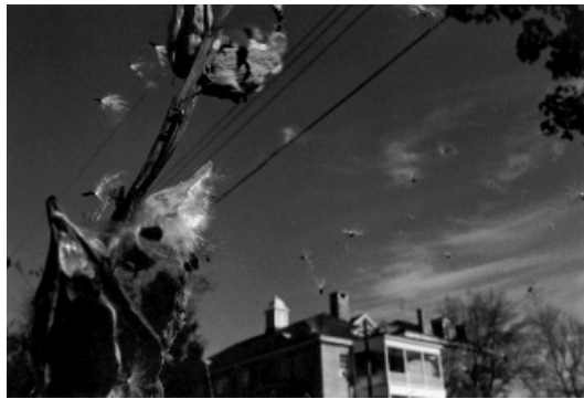
FIGURE 1. Stephanie's first black and white print, in Photography I, in response to the question: If you were to be struck blind tomorrow, what vision of the world would you leave?

To which I responded, "Does it matter what I want you to photograph? More importantly, does it address the question in a way that you would feel comfortable with this as a statement of how you see?" We then discussed some of the finer points of photographic printing and the link between visual qualities and emotional expression. Instead of darkroom techniques, Dorothea Lange's photographs, or a specific cultural phenomena becoming the focus of the assignment, they became the support for the artistic inquiry of students.