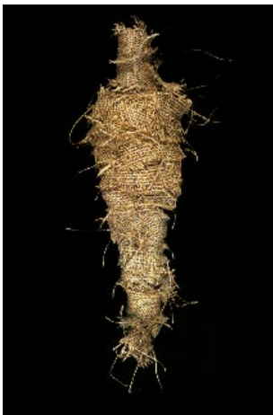
FIGURE 3. Selected image from Alex's wrapped human forms series in Photography 3

During one of my prompts that asked students to respond to a personal space, Alex began wrapping dolls and photographing them (Figure 3). What resulted was an exquisite series of wrapped human forms in myriad materials, floating in black, and printed almost life size. When it was the time for our group critique, her classmates gathered around her work, curious as to what had happened. Alex's response was, “I'm sorry Mr. Castro, but I didn't do the assignment.” Surrounding her work were the images of her peer's; landscapes and interiors, much as one would expect from a prompt like the one I had given. Seeing her work differ so greatly probably made her feel as though what she did was outside the expectations of the assignment. How would I mark her work according the rubric created? Hours were spent meticulously crafting her images and a well-developed sense of design and color was used. I couldn't help but feel what it would be like to be wrapped in those materials, the space within.