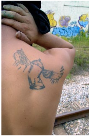
FIGURE 6. Jon's response to the question: Who is this person to me? Photography 4